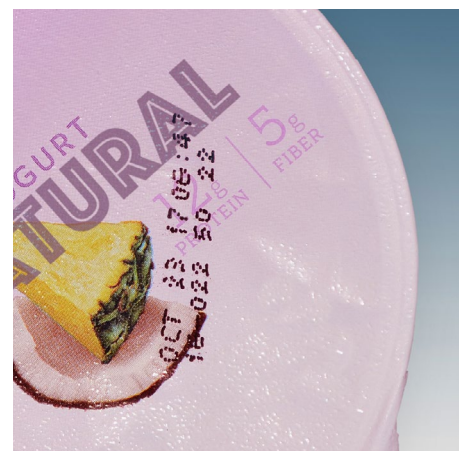
Examples of codes impeding product messaging